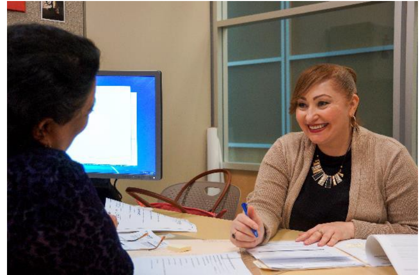
SDHC Achievement Academy Participant meeting with SDHC Workforce Readiness Specialist 5.8.17