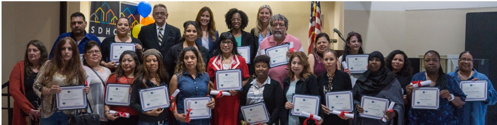
Family Self-Sufficiency Graduation Ceremony Malcolm X Library – 5.30.18